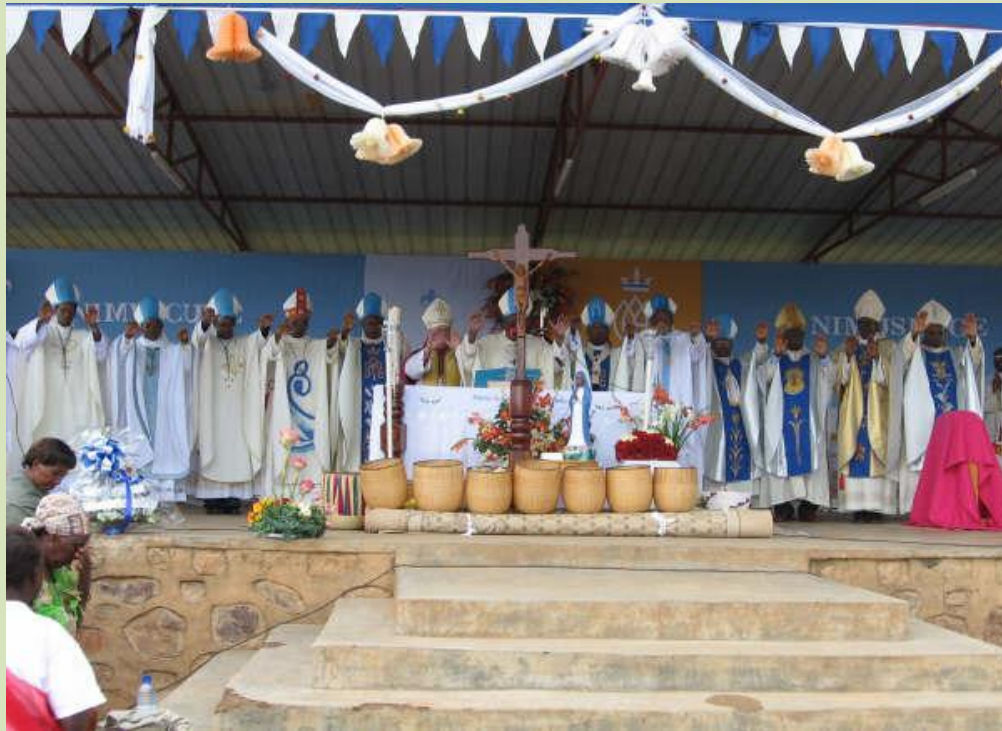
Kibebo, the first apparition; so far recognized by the Church in Africa

May therefore Kibebo become, without delay, a place of pilgrimages and appointments for God's searchers, who go there to pray, a high place of conversions, reparation of the sin of the world and reconciliation, a point of rallying for "those that were scattered", as for those that are attached to values of compassion and fraternity without borders, a high place that reminds the Gospel of the Cross (Bishop of Gikongoro Declaration, 29.06.2001, nr. 14.)