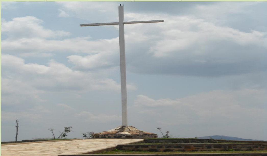
The "Calvarium" of Kibeho