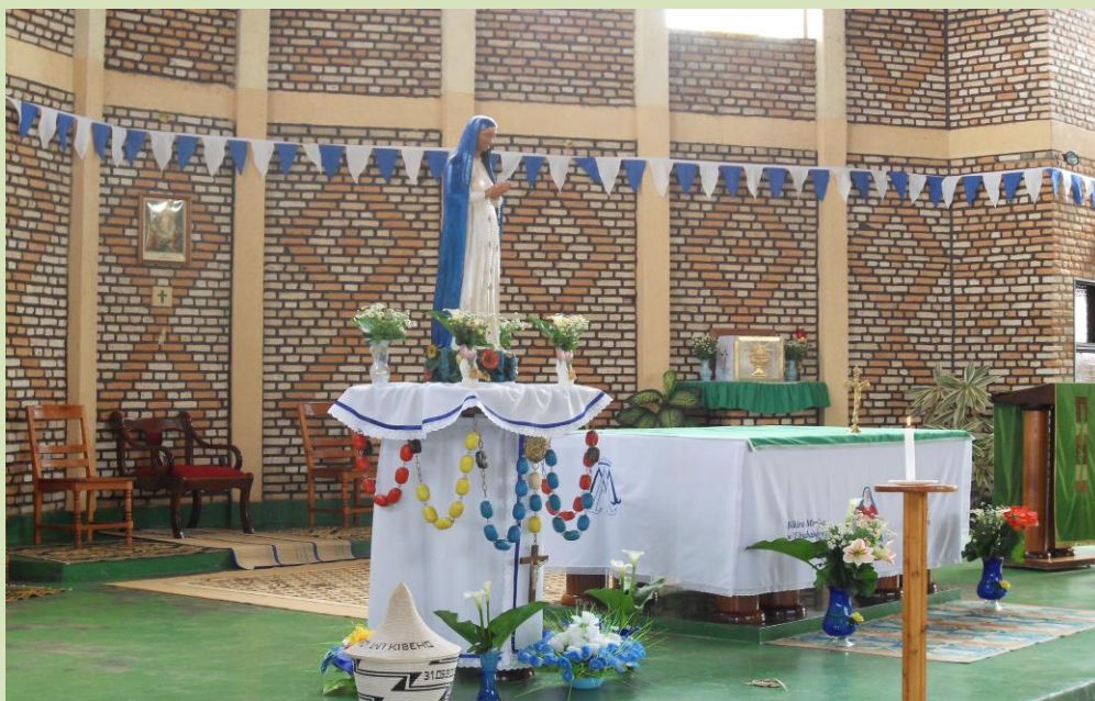
Our Lady of Kibebo statue inside the shrine

May therefore Kibebo become, without delay, a place of pilgrimages and appointments for God's searchers, who go there to pray, a high place of conversions, reparation of the sin of the world and reconciliation, a point of rallying for "those that were scattered", as for those that are attached to values of compassion and fraternity without borders, a high place that reminds the Gospel of the Cross (Bishop of Gikongoro Declaration, 29.06.2001, nr. 14.)