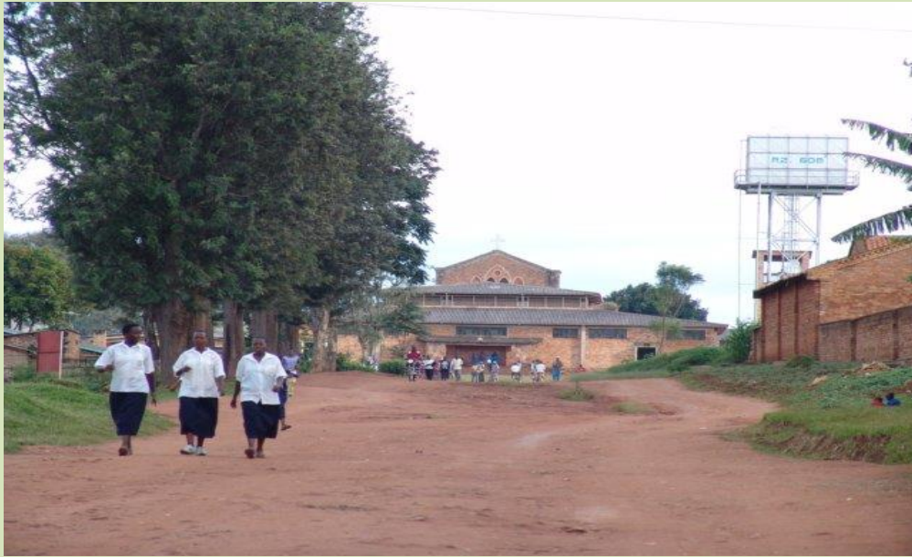
The first Catholic Church built at $AVE Rwanda in 1900